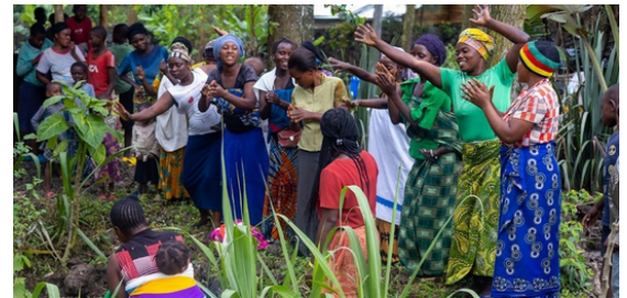
The Basandja Coalition

The intricate ecosystem of the Congo Basin supports indigenous communities, provides habitats for countless species, and sustains the livelihood of millions of people who rely on its resources for food, medicine, and shelter